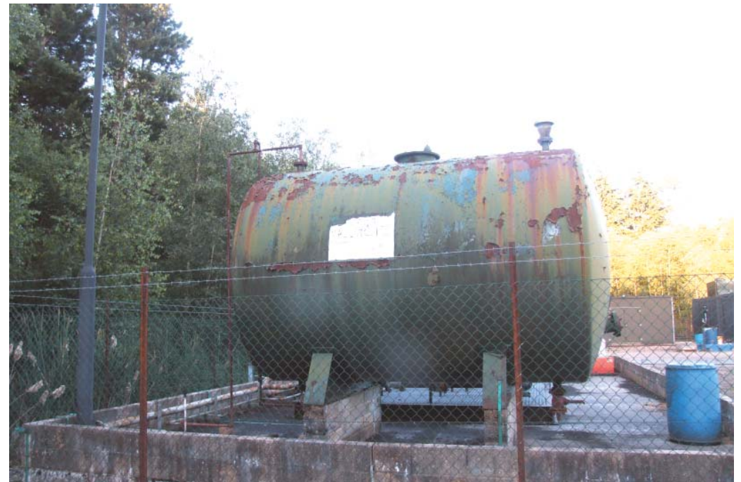
External corrosion on condensate storage tank