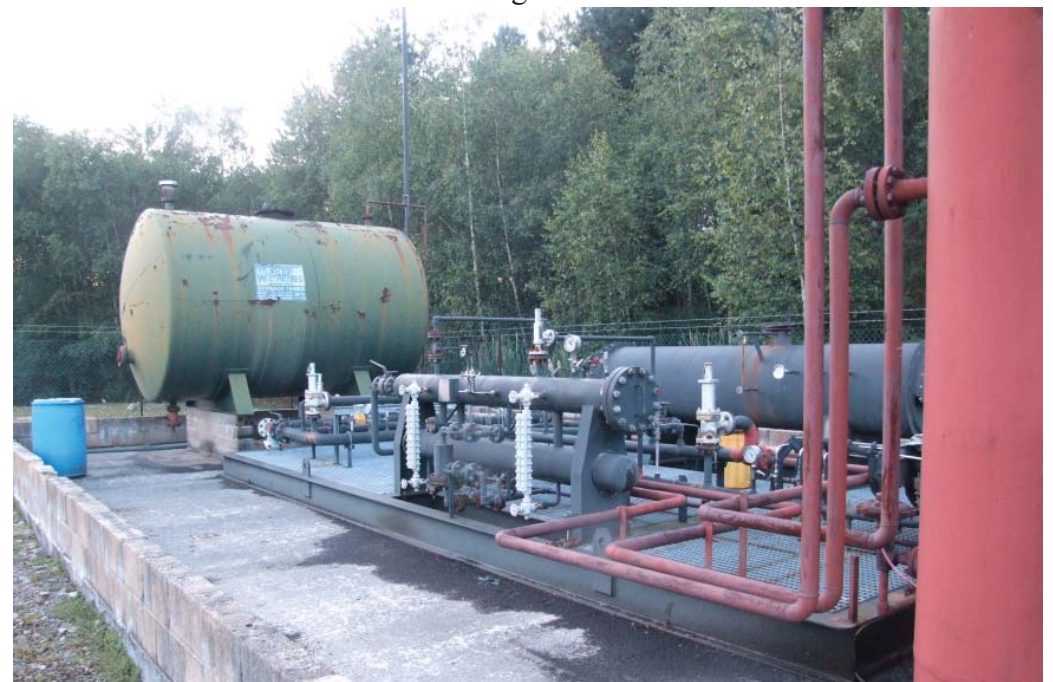
Plant skid showing external corrosion